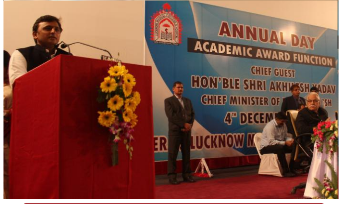
Chief Minister Uttar Pradesh Akhilesh Yadav Appreciates Research Work Undertaken in ELMC&H