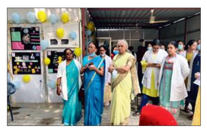
WORKSHOP ON "BASIC AND ADVANCED MOLECULAR BIOLOGY TECHNIQUES" (BAMBT2022)

A Two day hands-on workshop on "Basic and Advanced Molecular Biology techniques" (BAMBT2022) was jointly organized by Department of Personalized & Molecular Medicine and Department of Biotechnology, Era University, Lucknow under the aegis of Indian society of Personalized Medicine and Indian Academy of Biomedical Sciences on March 30-31, 2022. The aim of the workshop was to acquaint the participants with a focused and comprehensive hands-on training on some basic and advanced molecular biology techniques. The workshop included sessions of lectures, and practical to impart thorough understanding about molecular biology techniques. The workshop was well attended by more than 30 faculty, research scholars and students.