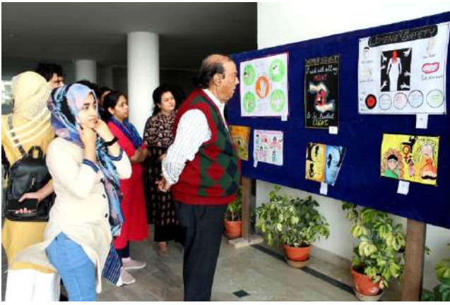
Visit of students of Era College of Pharmacy to CSIR-CDRI

Students of Era College of Pharmacy visited CSIR-CDRI on September 25, 2019. The latter is a dream institute for any research aspirant to work at. The main aim of this visit was to provide them an exposure of research set-up, motivate them towards research in pharmaceutical sciences and apprise