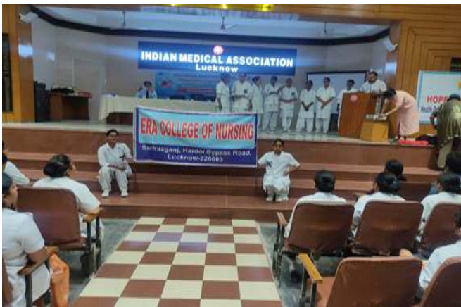
On stage program by students of Era College of Nursing