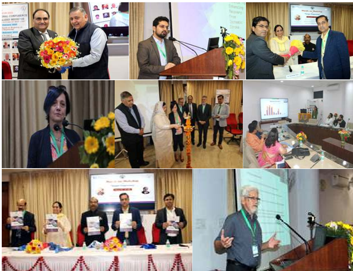
Snippets from International Conference on Personalized Medicine and workshop on “Sanger Sequencing”