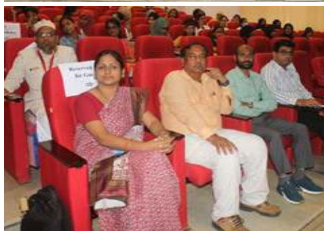
Organizing committee members and participants at National Conference on Sustainable Environment