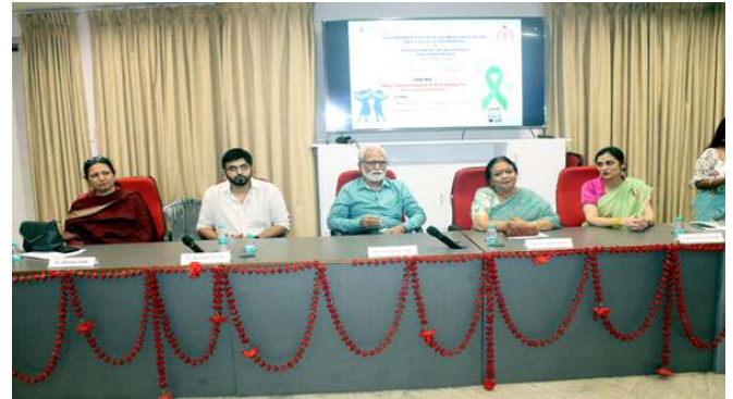
Dignitaries at World Mental Health Day

and Department of Clinical Psychology organized a 5 day celebration for World Mental Health Day 2022, which started on the October 6, 2022 and came to closure on October 11, 2022.