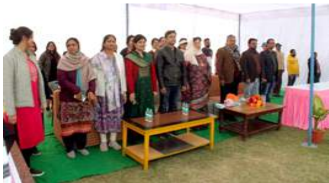
Snapshots from the Sports Week