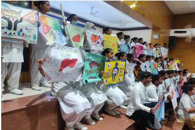
Students from Era College of Nursing displaying posters on Hepatitis Awareness