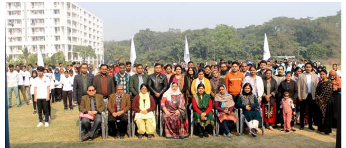
Hon'ble Vice Chancellor, post-inauguration of UDGHOSH-Sports and Cultural week with faculty members and students of Era University

Competition (Girls) in 100 metre Trojans won the first place, second position was bagged by Warriors followed by Soft Spartan at the third place. In 200 metre race category (boys) Trojans, Warriors and Soft Spartan secured the first, second and third place respectively. In 400 metre race held for boys, team Warriors again bagged the first position and Panthers achieved the second position.